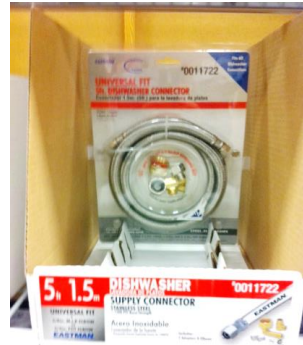
Tray Bin Box