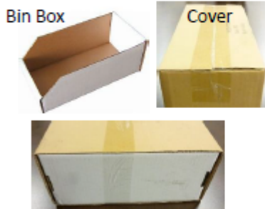
Tape Cover to Bin Box