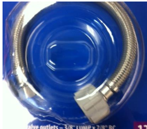
Trap Blister w/ Bubble